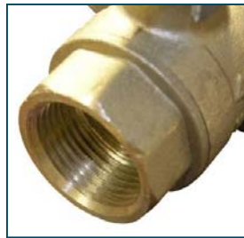
Fig. 470 - FNPT