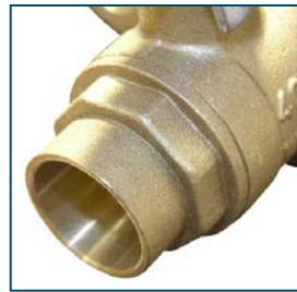
Fig. 475 - Sweat