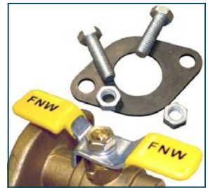
Includes T-handle, Gasket, and Hardware