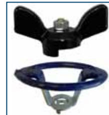
Tee or Oval Handle